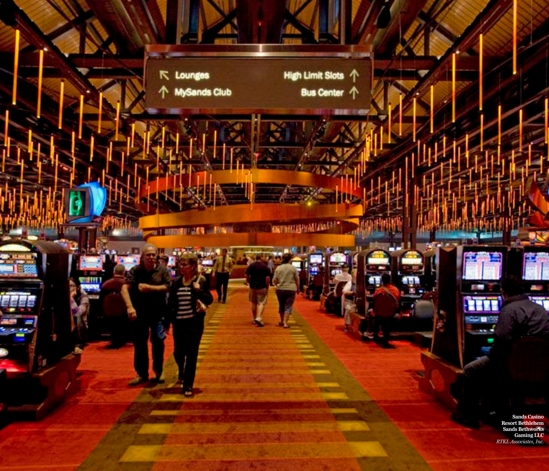
Sands Casino Resort Bethlehem Sands Bethworks Gaming LLC RTKL Associates, Inc.