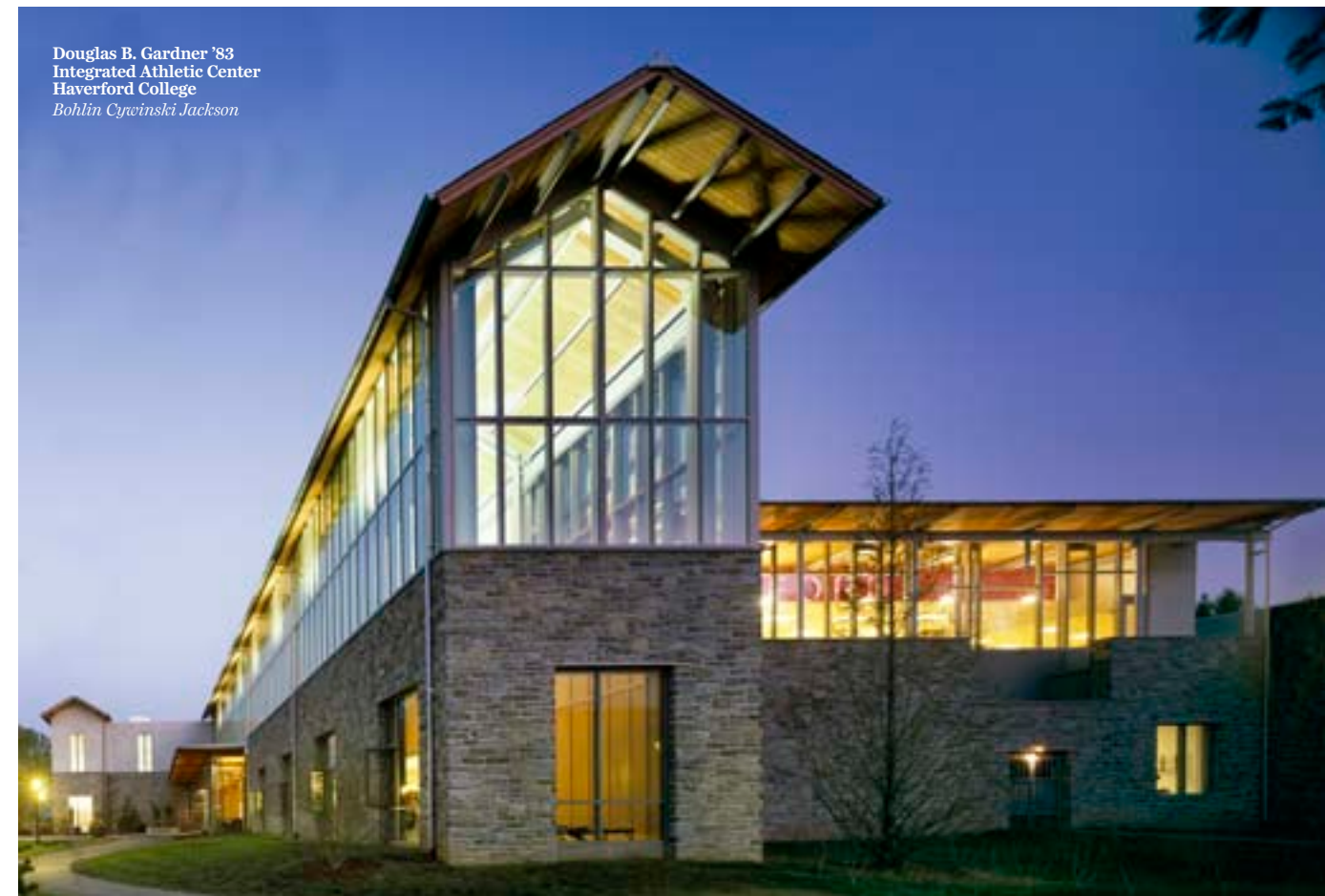
Douglas B. Gardner '83 Integrated Athletic Center Haverford College Bohlin Cywinski Jackson

Proactive in employing professionals accredited by LEED (Leadership in Energy and Environmental Design), we are consistently ranked among the nation's Top 100 Green Contractors.