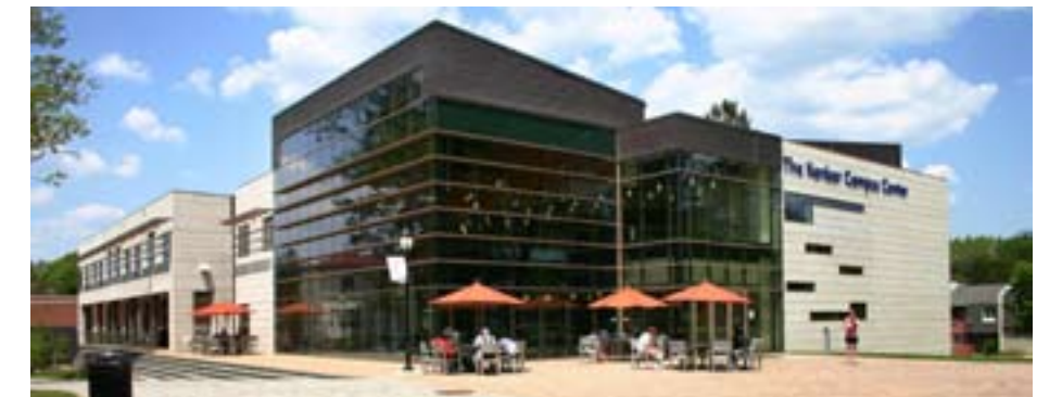
Kanbar Campus Center and Parking Garage | Philadelphia University Shepley Bulfinch Richardson & Abbott

Our unique and carefully refined approach to construction management takes teamwork to a higher level. Our partnering services focus your project's team on specific goals prior to construction, so your results are accomplished more quickly, more economically and more remarkably.