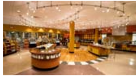
Cafeteria | University Center DeSales University | Breslin Ridyard Fadero Architects

Our team includes more than 170 talented professionals with billions of dollars in construction management experience and expertise specific to the industries we serve.