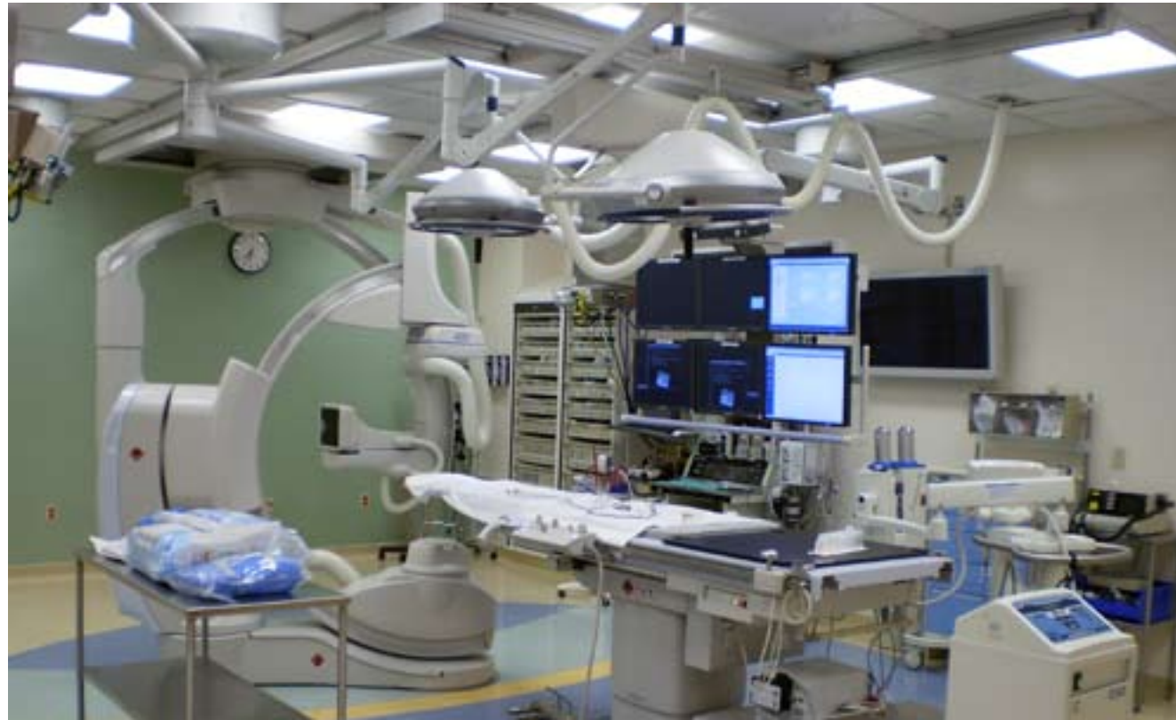
Hybrid Catheterization Lab | A.I. duPont Children's Hospital | Array Healthcare Facilities Solutions