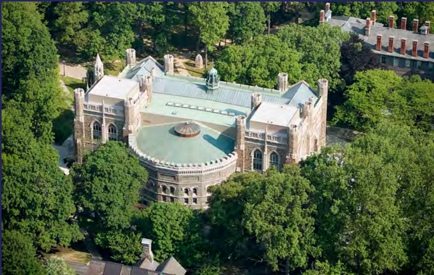
Lehigh University Linderman Library Bethlehem, PA Alvin H. Butz, Inc.

The Butz Family of Companies is currently managing $355 million of construction including $85 million of higher education projects. With more than two centuries of combined business operations, we offer a unique level of experience and a legacy of quality and commitment. Together, we provide a synergy of three teams with market experience that share strong values and one common goal . . . your complete satisfaction.